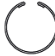
OPEN HEMMED TUBE