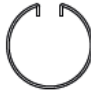
FLANGE IN TUBE